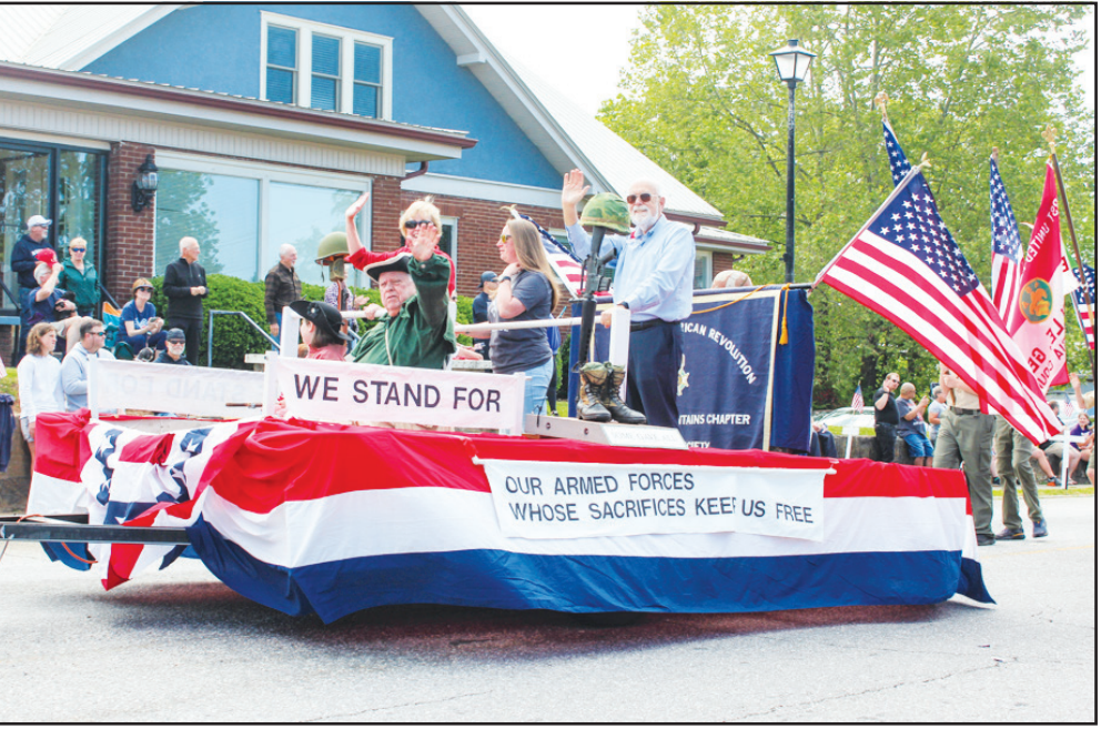
The Sons of the American Revolution entered this patriotic float in the 2023 Memorial Day Parade, which is set to roll through town again Saturday morning.

By Brittany Holbrooks North Georgia News Staff Writer