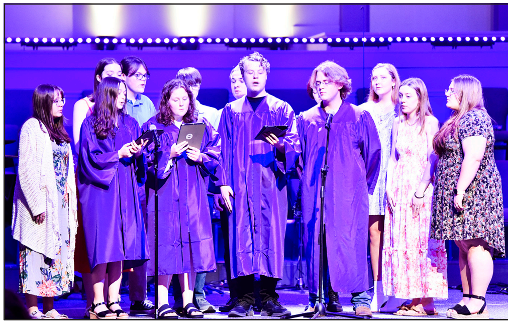
UCHS Ensemble students performed "Homeward Bound" for their classmates in the May 19 Baccalaureate Ceremony at First Baptist Church.

Ellie Adams opened the primarily senior student-led service with the welcome invocation, followed by