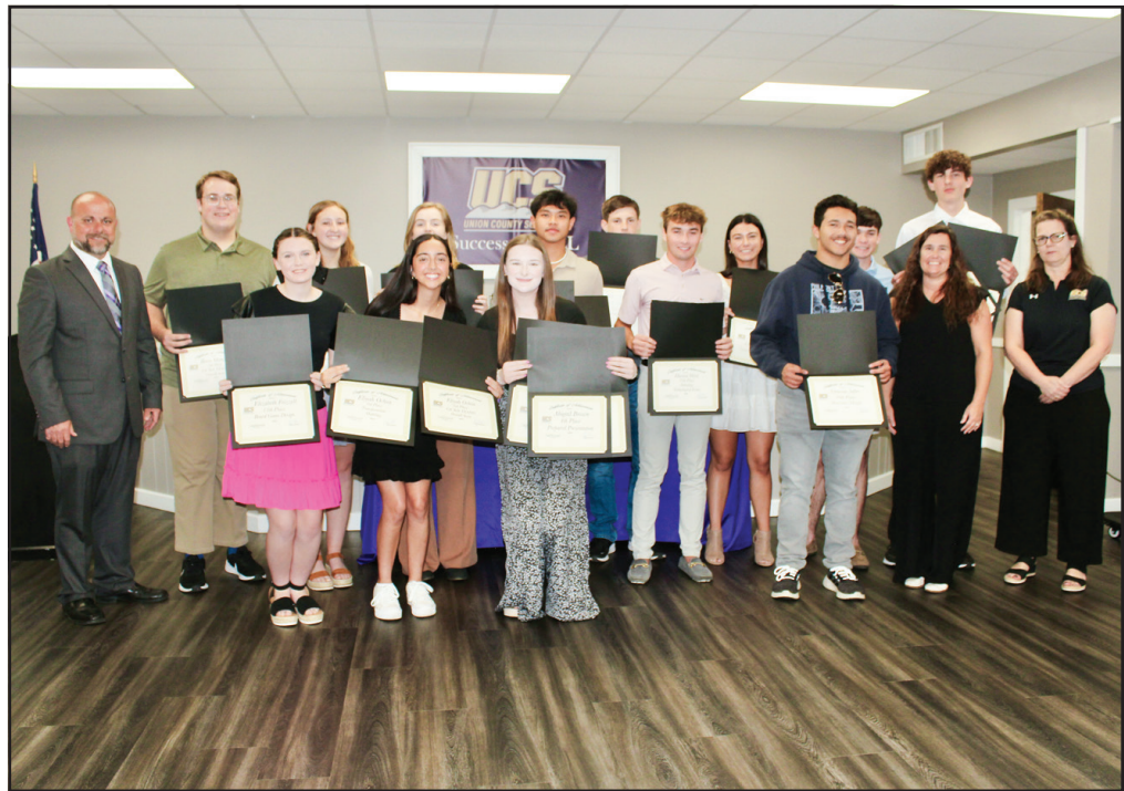
Technology Study Association members received kudos and certificates of appreciation in the Board of Education meeting last week.

he has made a difference when it comes to getting kids ready to join the workforce, and that he's ready to lead UCHS into the future.